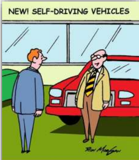
"And, if you fall behind on payments, it drives itself back to the dealership."